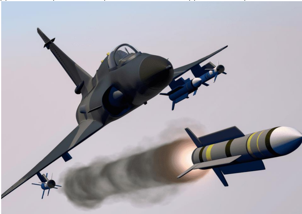
“Omnetics uses a stamped and formed flex pin to achieve the required normal forces.”

have a continuous current rating of 1 Amp. standard voltage ratings for Nano-D connectors are 250 V at sea level. Micro-D and Nano-D connectors offer a wide temperature range; from Space to Downhole Micro-D and Nano-D connectors are available with temperature ranges as wide as -55°C to +200°C. This wide range makes the connectors attractive in a variety of applications. For space, the low-temperature rating, combined with low outgassing materials and significant weight and space savings, helps reduce payloads at liftoff and provide long-term reliable operation. The performance and reliability at cryogenic temperatures, along with the low outgassing material properties, has led to an increased usage in space applications. Such applications include nitrogen-cooled optics, low and high-earth orbiting satellites, telescopes, deep space probes, orbiters, and rovers. At the opposite extreme, the high- temperature rating makes Micro-D and Nano-D connectors popular for downhole applications in petroleum exploration. Downhole application temperatures can exceed +175°C.