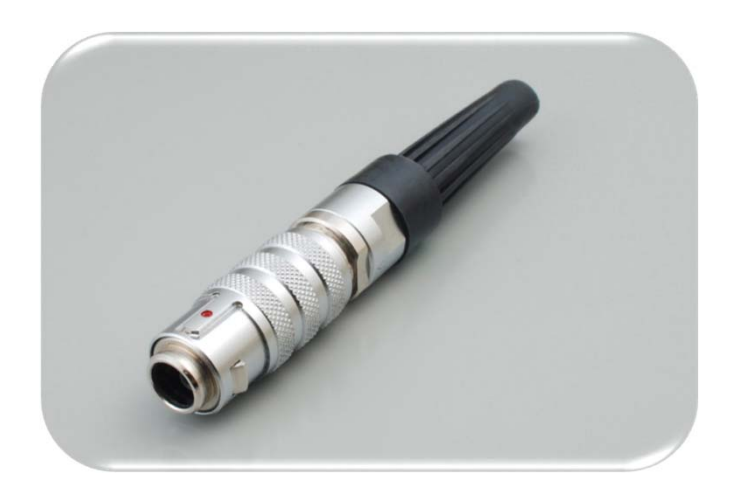
*Contact Sales for additional available color options other than standard black